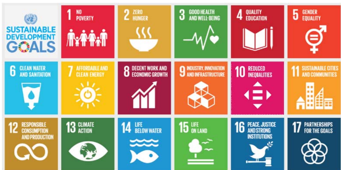
Figure 1. Sustainable Development Goals Accepted by the UN General Assembly

The mission of the United Nations Office for Outer Space Affairs (UNOOSA) is to promote international cooperation in the use of outer space to achieve development goals for the benefit of humankind. There is no better example of UNOOSA's vision 'to bring the benefits of space to humankind' by showing space's importance in the realization and implementation of the 17 Sustainable Development Goals (SDGs) shown in Figure 1.